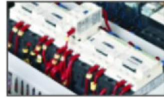
电器部分采用施德、富士、欧姆等著名品牌产品 Electrical parts are selected strickland, fuji, ohm and other famous brand products.