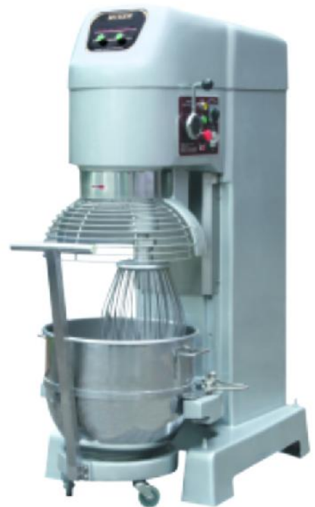
B80 料桶液压升降 Bowl Hydraulic Lift And Down