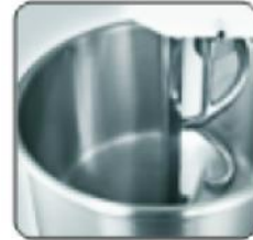
加厚不锈钢冲压面桶 Thick stainless steel with stamping surface