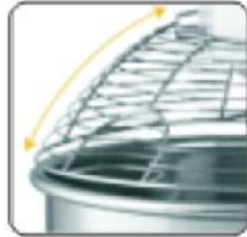
弧形抛物线设计 Arc parabola design