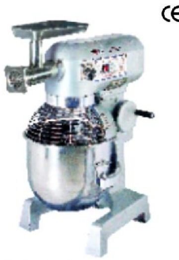
B20-F四功能 Four Function