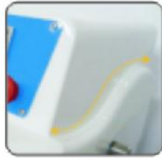
马鞍形设计 Saddle-shaped design