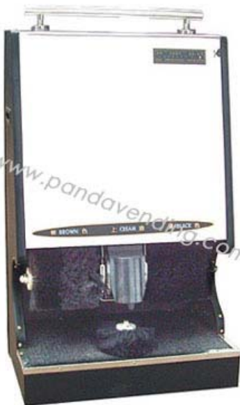
TR-XB1- Biz Type W/Side-Cleaner