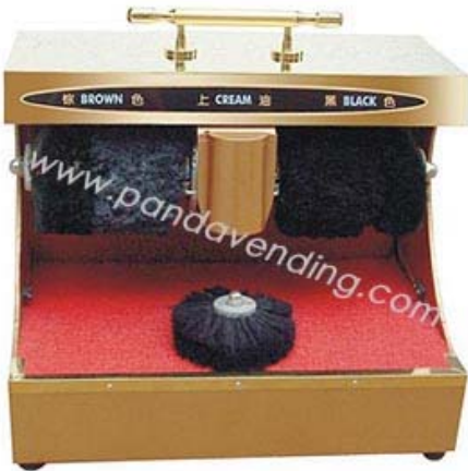
TR-XB2- Office Type W/Side- Cleaner