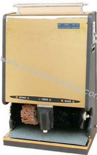
TR-TB- Classic Coin Shoe Polisher