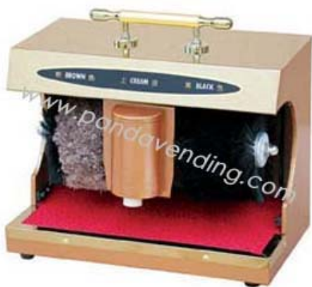
TR-G4- Family- Use Shoe Polisher