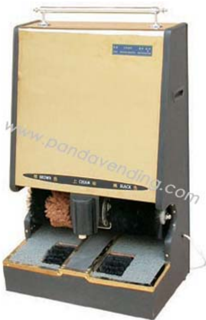
TR-G5- Office Type Simple Polisher