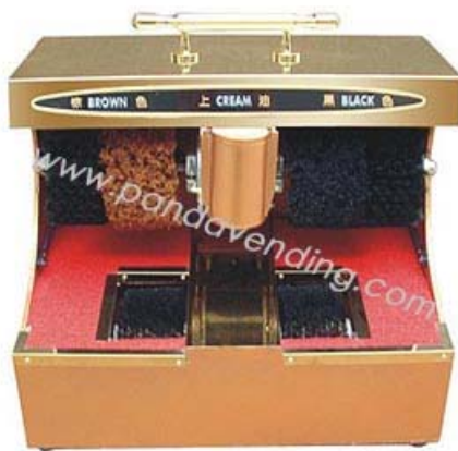
TR-XD1- Office Type W/Sole- Cleaner