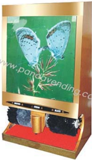
TR-DX- Single AD Shoe Polisher