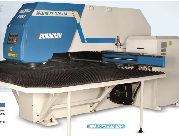
RPP 1270 x 30 TON